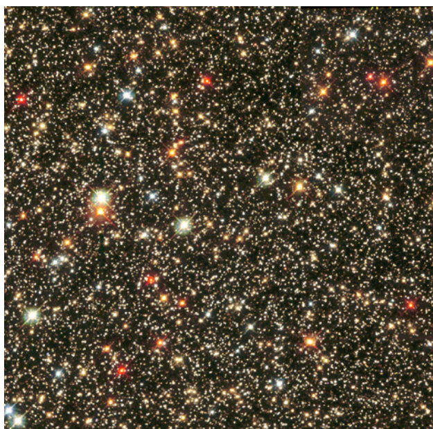
Figure 17.3 Sagittarius Star Cloud. This image, which was taken by the Hubble Space Telescope, shows stars in the direction toward the center of the Milky Way Galaxy. The bright stars glitter like colored jewels on a black velvet background. The color of a star indicates its temperature. Blue-white stars are much hotter than the Sun, whereas red stars are cooler. On average, the stars in this field are at a distance of about 25,000 light-years (which means it takes light 25,000 years to traverse the distance from them to us) and the width of the field is about 13.3 light-years.